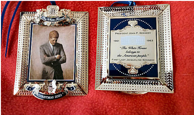
2020: John F. Kennedy ornament